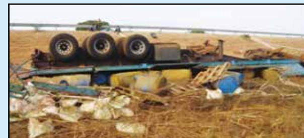
Vehicle accident during transportation of Ammonium Nitrate at Ruaha - Tanzania.