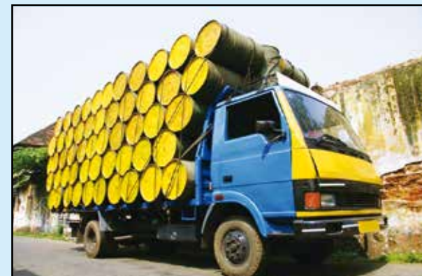
In 2010 alone, more than 2,300 incidents involving the transport of dangerous goods by companies were recorded Worldwide.